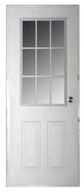
Eliminator Door With Optional 9-lite window